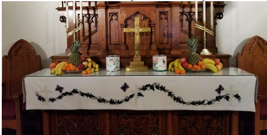
Fruit on the Altar for the Food Pantry